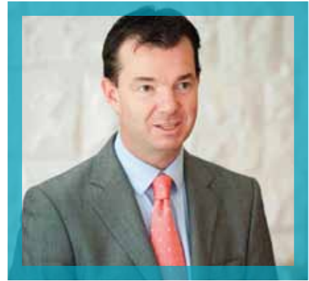
Guy Opperman MP took our users' concerns to the Minister for Disabled People

The MP heard concerns raised by members including planned cuts in the DLA, the length of the DLA claim form at 40 pages and regular assessments of claimants with long term disabilities. He agreed to take the concerns to Maria Miller, Minister for Disabled People.